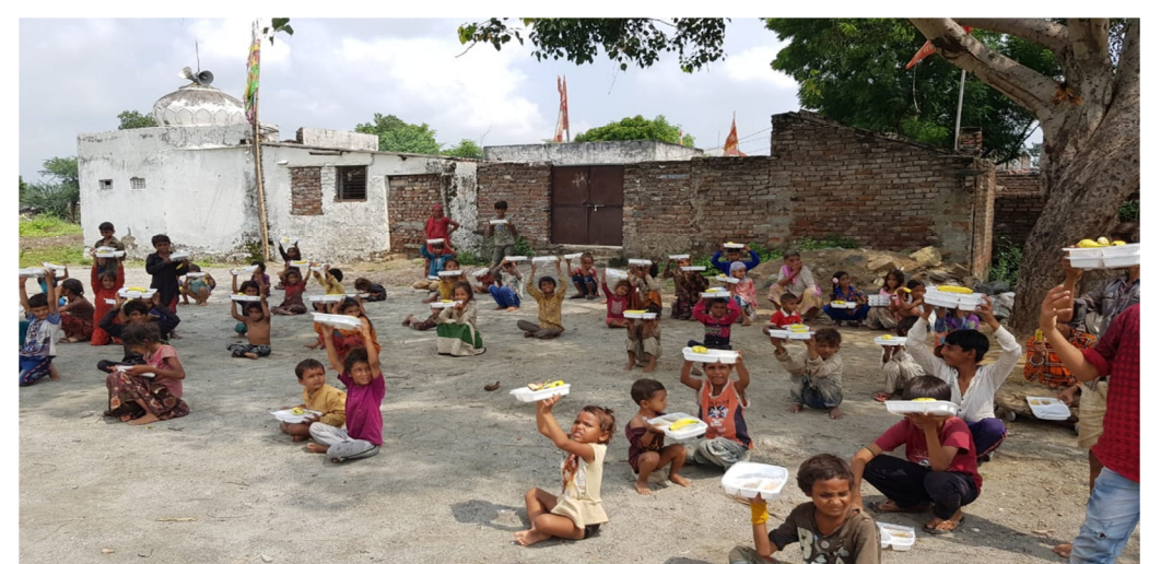
Corporate Social Responsibility: - Manomay Tex India Limited was Distribution of Food Facility to Students of Muskan Shikshan Kendra School, Bhilwara under CSR Activity of Eradicating Hunger .

9. Specify the reasons(s), if the company has failed to spend two percent of the average net profit as per section 135(5).